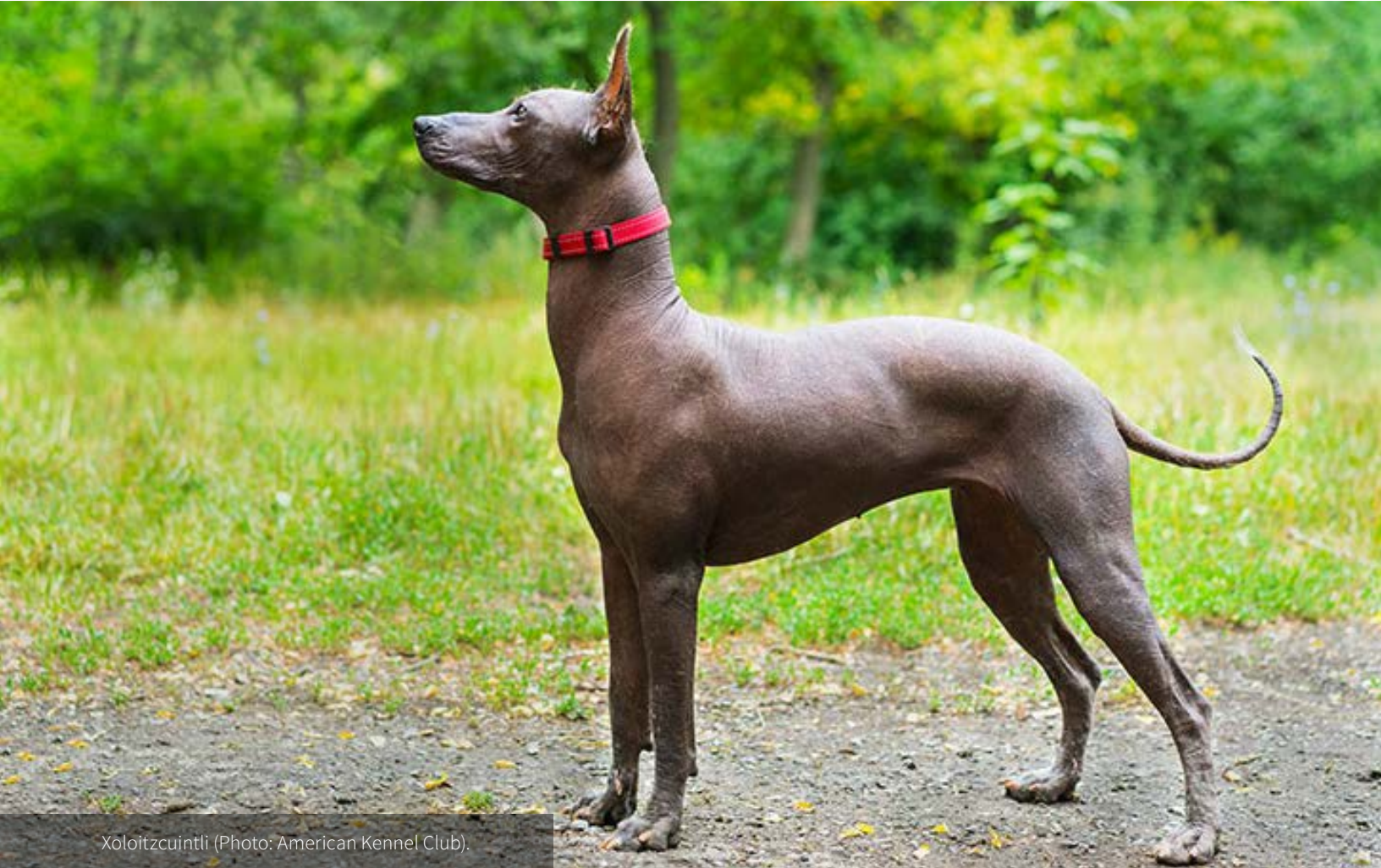
Xoloitzcuintli (Photo: American Kennel Club).