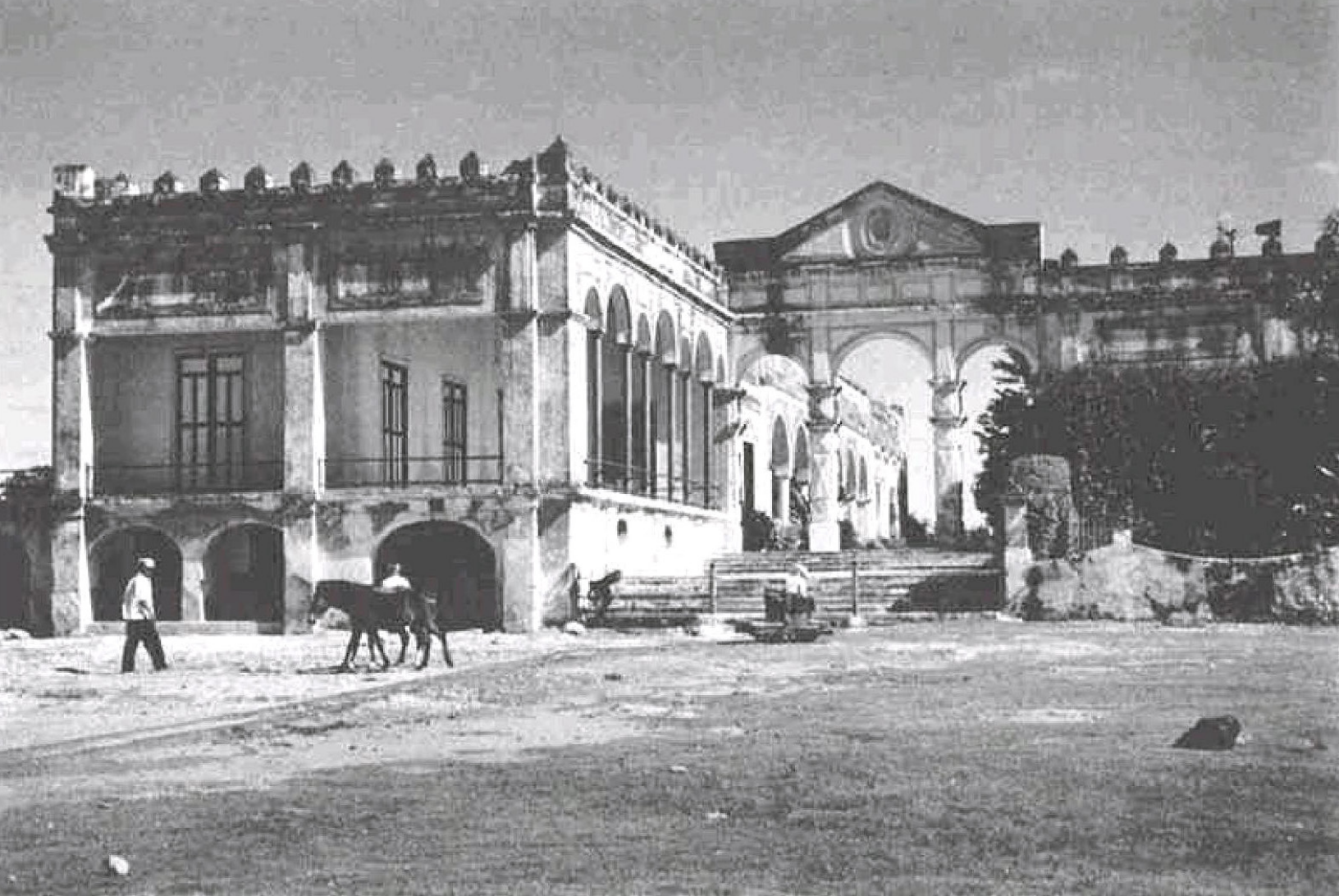
Hacienda Yaxcopoil. Yucatán residence.