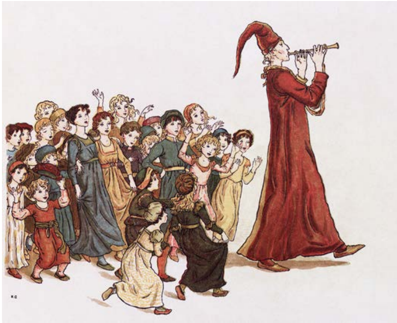
Pied Piper by Kate Greenaway