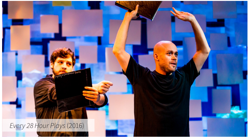
Every 28 Hour Plays (2016)