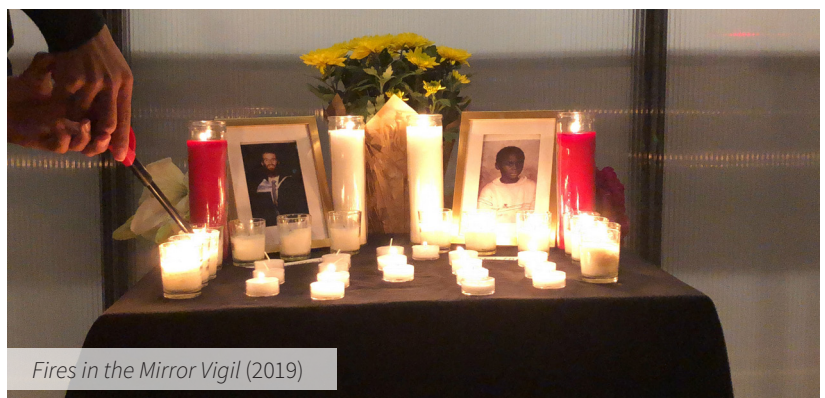
Fires in the Mirror Vigil (2019)